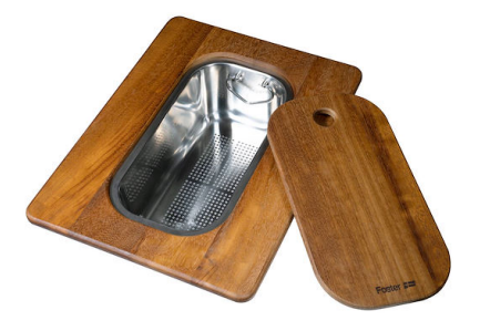
Iroko-wood sliding chopping board with stainless steel colander