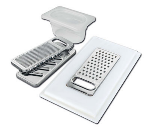
Grating kit complete with ring support and food collection tray