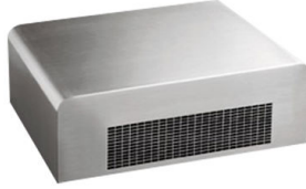
Motor for outdoor installation 2459 931