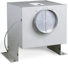
Motor for indoor installation 2459 941