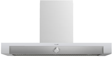
Cucinotta Hood 48"