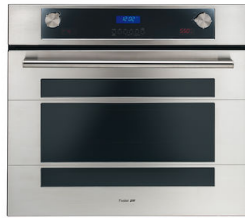
Oven Milano single Stainless Steel 30"