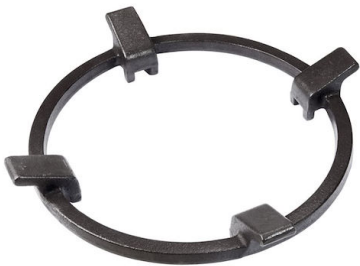
Cast Iron Wok Support