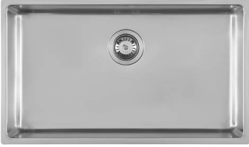
KE Sink 30" x 17" – U/M 2157 863