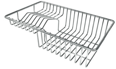
Stainless Steel dishes holder