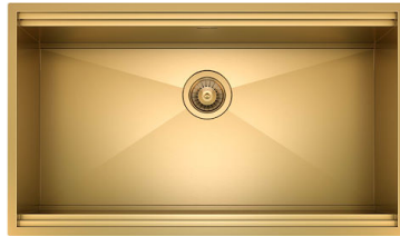
Sink Leonardo Gold 33" x 20" – U/M