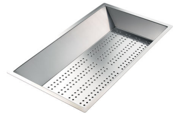
Stainless steel perforated pan